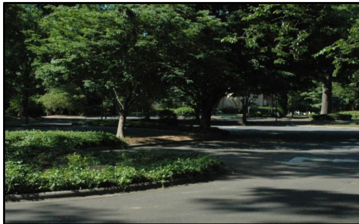
Figure 12.11-2: Example of parking lot broken up by landscaping.