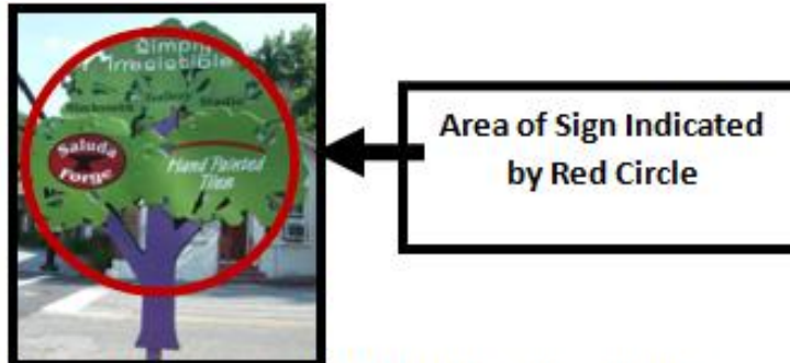
Example Illustrating Measurement of the Area of an Irregularly Shaped Sign

SIGN COPY. Any graphic design, letter, numeral, symbol, figure, device or other media used separately or in combination that is intended to advertise, identify or notify, including the panel or background on which such media is placed.